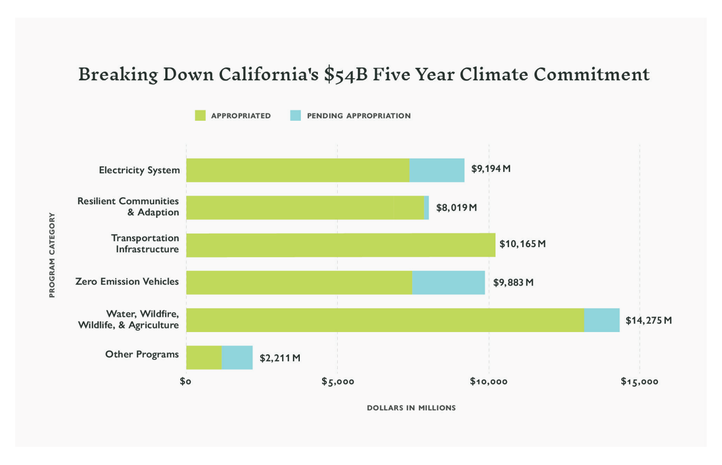
The 2022-23 Budget is $303 billion which is greater than the expenditures of some countries. With or without a surplus, California annually spends billions on baseline services across government agencies and departments.

As the State contemplates both new spending (capital projects or programs) and baseline spending–climate must be front and center. As part of the State Budget process, each State entity must submit a <u>Budget Change Proposal</u> (BCP) outlining their request and rationale for new spending. BCPs are formal documents used by the Governor to determine if a proposal should be included in the Proposed Budget. If the BCP is included in the Proposed Budget it is shared with the Legislature as part of budget negotiations.